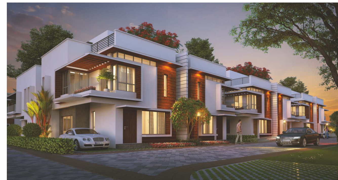
Lilac Type C (Left Side) 3 BHK with study room & car park