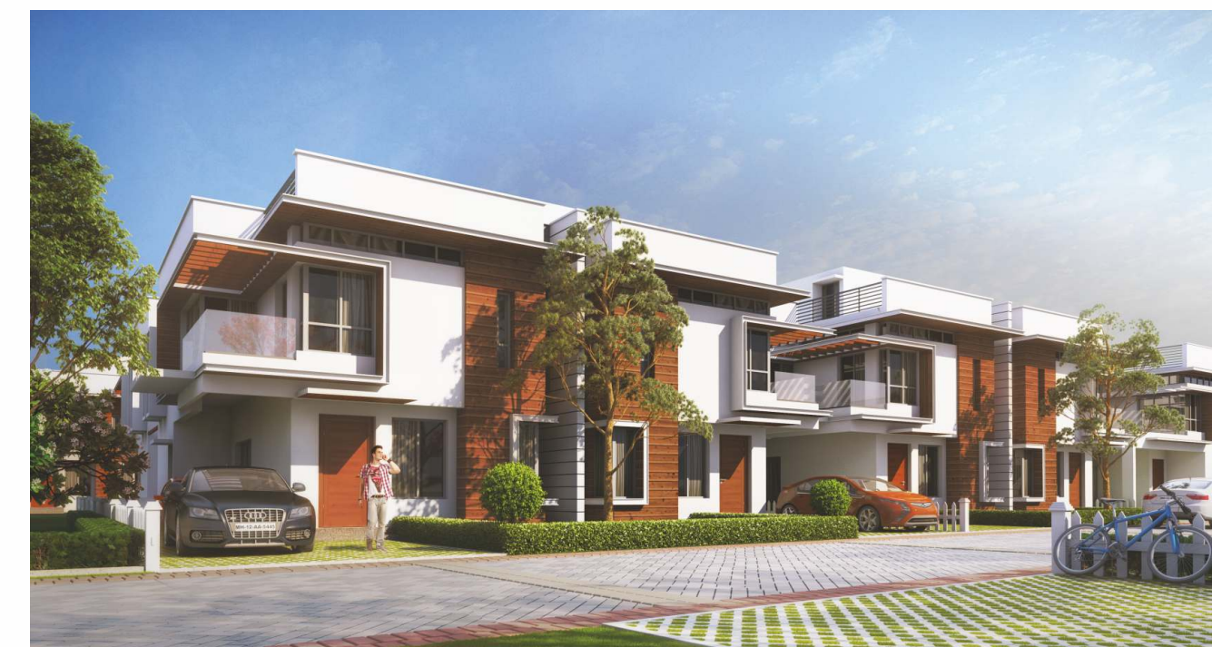
Jasmine Type B (Left Side) 3 BHK with Study room & 1+1 car park