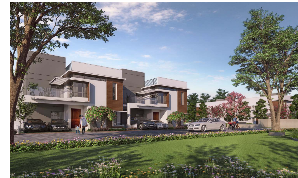
Primrose Type A 4 BHK with 2 Car Park and servant room