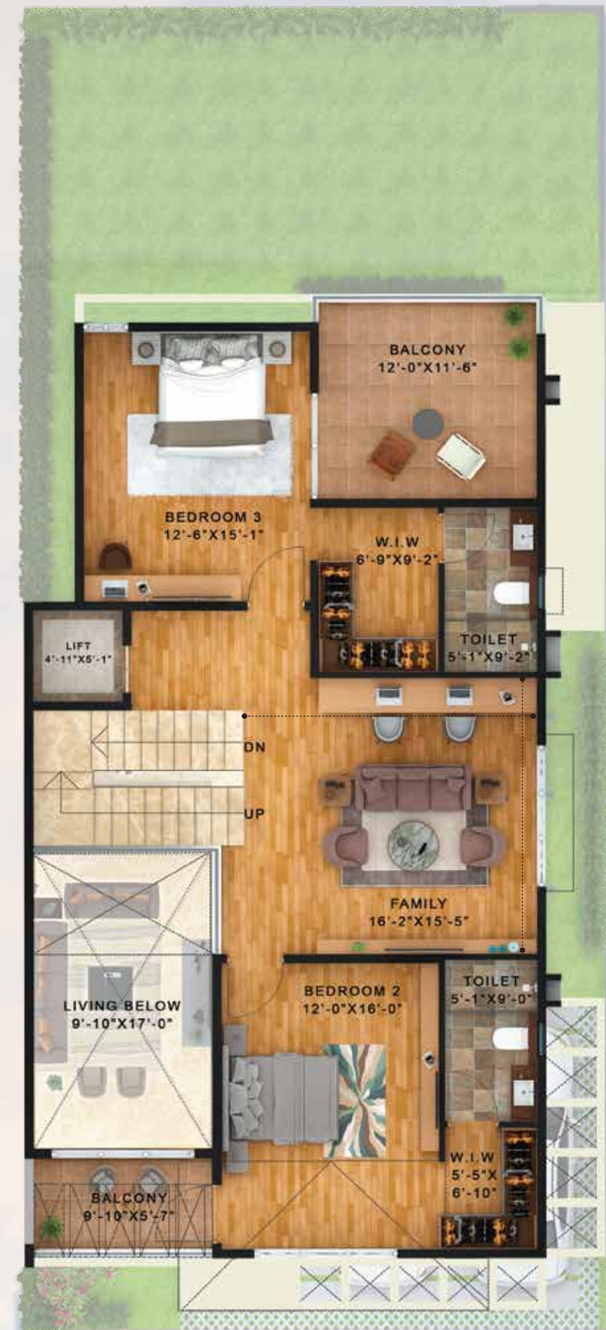
First Floor Second Floor